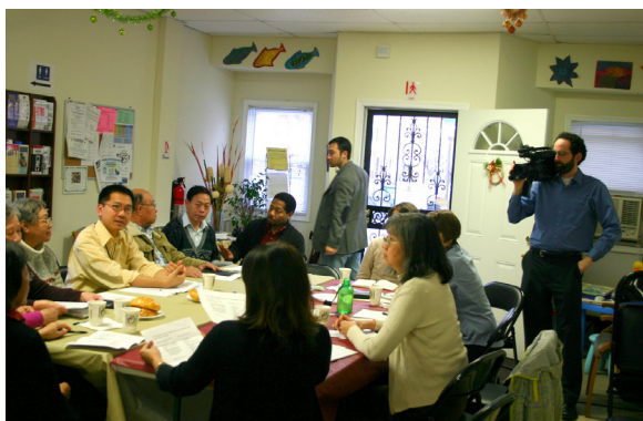
Above: Discussing Asian Health Initiatives progress with community stakeholders

participation, and the role of public health communication in affecting the health of this community.