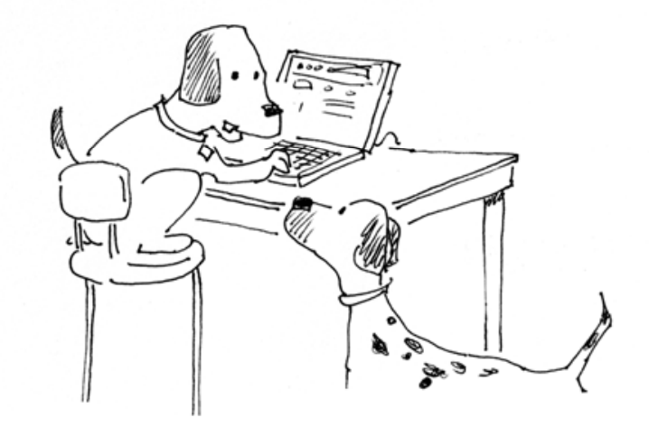
"On Facebook, 273 people know I'm a dog. The rest can only see my limited profile."