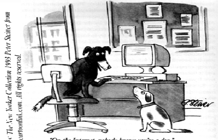
"On the Internet, nobody knows you're a dog."