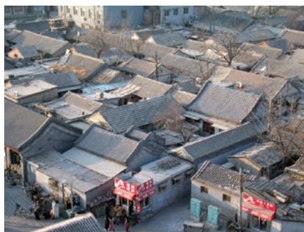
A hutong in Beijing: with a population of over 1 billion, China’s health burden is significant and will continue to grow as workers migrate to urban centers.

International partnerships are vital to the growth of China’s young biotech industry. In our survey, some small companies state that