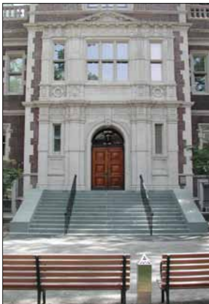
John Morgan Building

The University of Pennsylvania was the first institution in the country to offer formal training in the biomedical sciences. For the past 240 years, Penn has been known for its ability to successfully integrate science and medicine. Today, Biomedical Graduate Studies (BGS) is the academic hub for biomedical graduate education at Penn comprising seven interdepartmental cross-school graduate groups: Biochemistry and Molecular Biophysics, Cell and Molecular Biology, Epidemiology and Biostatistics, Genomics and Computational Biology, Immunology, Neuroscience, and Pharmacological Sciences. Over 600 scientists and educators represent more than 30 basic science and clinical departments in five schools throughout the University. Approximately 40% of the faculty are M.D.s or M.D./Ph.D.s housed within clinical departments, making Penn uniquely qualified to train tomorrow's leaders in translational research.