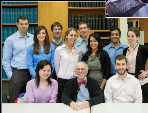
Left: Med Fellows in the Northeast regional group meet with Dr. Eric Kandel, Nobel laureate and HHMI senior investigator