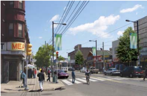
Photo rendering of the Development Strategy for the Woodland Avenue Revitalization Project (WARP)