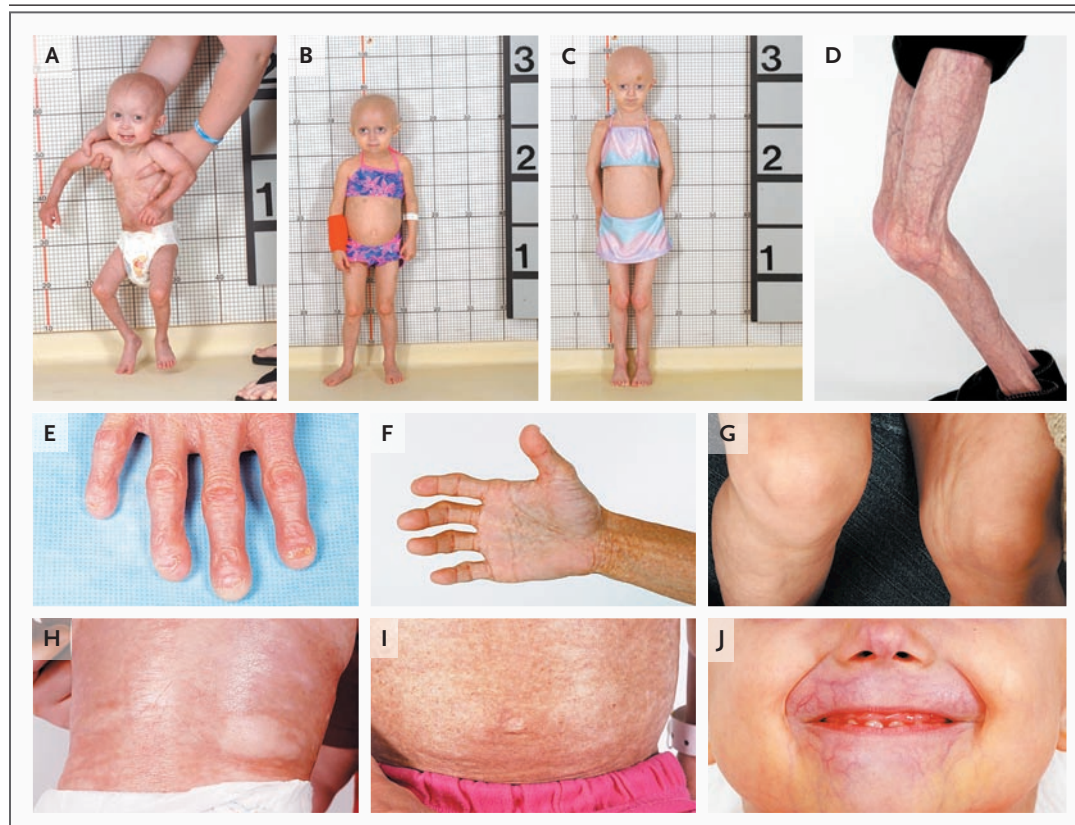
Figure 1. Physical Findings in Children with Hutchinson–Gilford Progeria Syndrome.

We enrolled 15 unrelated white children (including 4 Hispanic children) in a protocol between February 2005 and May 2006. Race was self-reported. This study was approved by the institutional review board of the National Human Genome Research Institute, and written informed consent and assent were obtained from all the patients and their parents, respectively. The molecular mutations in four children were previously reported, 4 Patient 9 was Patient 3 in another report, 11 and Patient 7 was pictured in a review of Hutchinson–Gilford progeria syndrome. 12 The weights of our patients, as record-