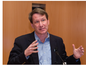
2013 Sylvan M. Cohen Visiting Scholar Dr. Norman Sharpless