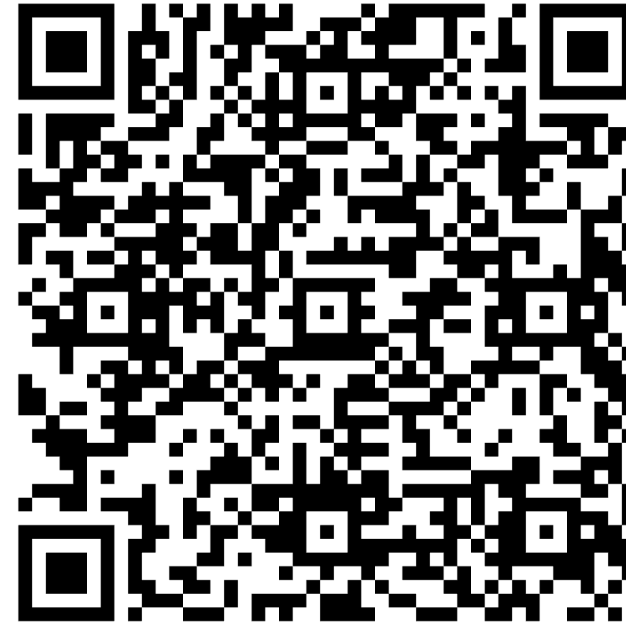
Register for Fall Kickoff Here

Attend our Fall Kickoff on September 8th at 6:30 PM to learn more!