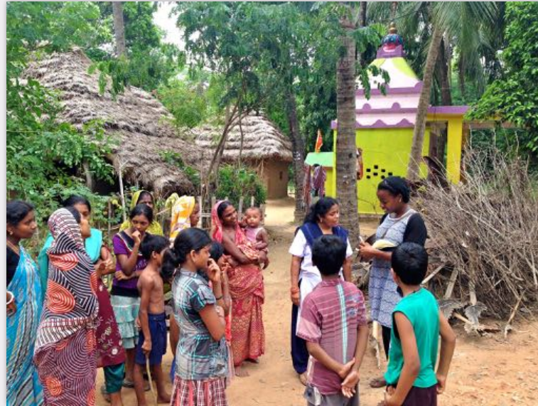
What my friends think I do