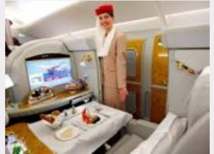
What my parents think I do