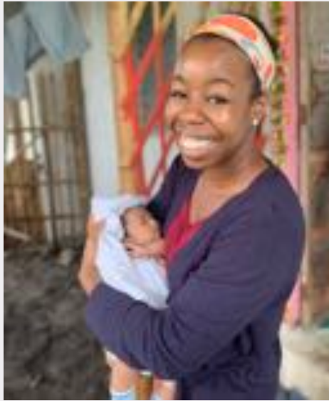
What I thought I be doing