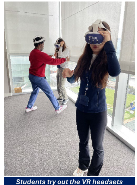
Students try out the VR headsets

"I couldn't care less if they ever pick up a VR headset again," he surmises, "as long as this effort gets them over that learning curve faster."