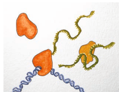
Figure 2. Small number effects promote stochasticity at the molecular level.

The other possibility is that stochastic individuality is actually