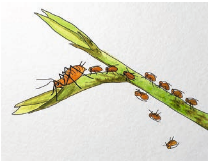
Figure 1. Genetically identical individuals reared in the same environment have different behaviors.

Here, a parthenogenetic pea aphid ( Acyrtosiphon pisum ) produces clonal daughters who show individual variation in startle responses. When startled by identical stimuli, some daughters cling to their perch on vegetation, while other genetically identical sisters leap off.