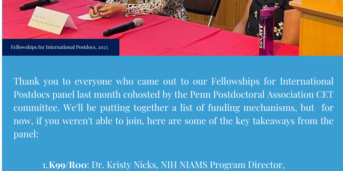
Fellowships for International Postdocs, 2023

Thank you to everyone who came out to our Fellowships for International Postdocs panel last month cohosted by the Penn Postdoctoral Association CET committee. We'll be putting together a list of funding mechanisms, but for now, if you weren't able to join, here are some of the key takeaways from the panel: