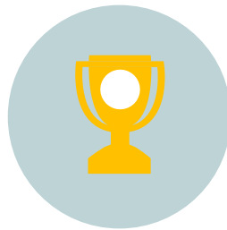
Soft Skill Courses