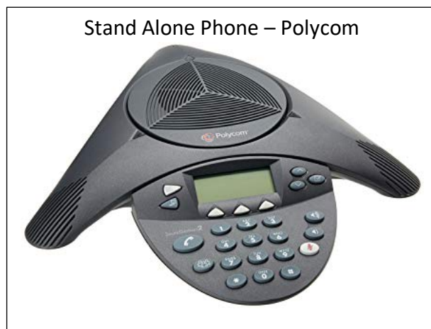
Stand Alone Phone – Polycom