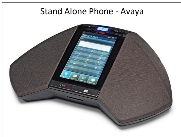
Stand Alone Phone - Avaya