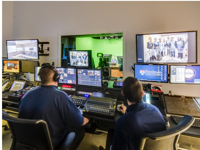
JMEC Studio control room