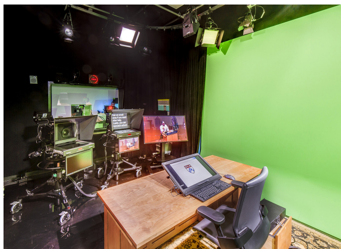
JMEC Studio showing SMART Board and teleprompter