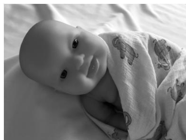
Sample 1 - No light on baby's face

Ideally, you want the baby's face to be lit. Notice in the first image how the baby's face is shadowed. This is remedied by using the flash OR by turning the baby so it is facing the light.