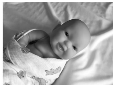
Sample 3 - Baby turned to face light