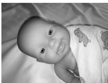
Sample 2 - On Camera Flash